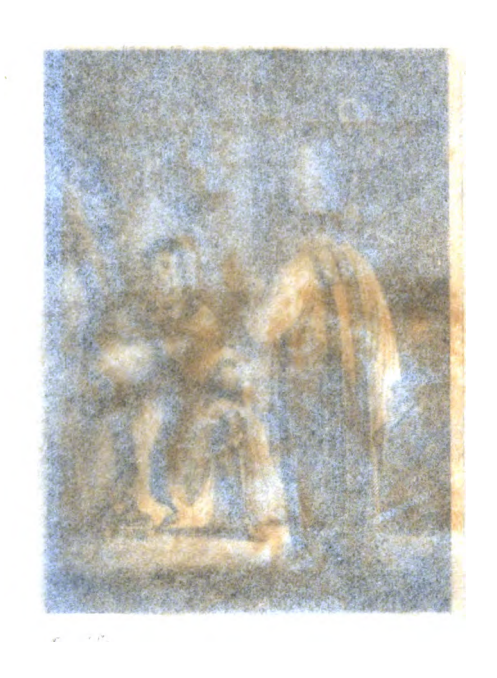
1 17 10