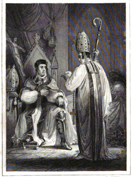
Drawn & Engan Steel